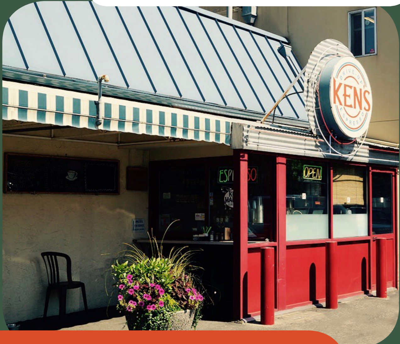
Ken's Market Queen Ann storefront