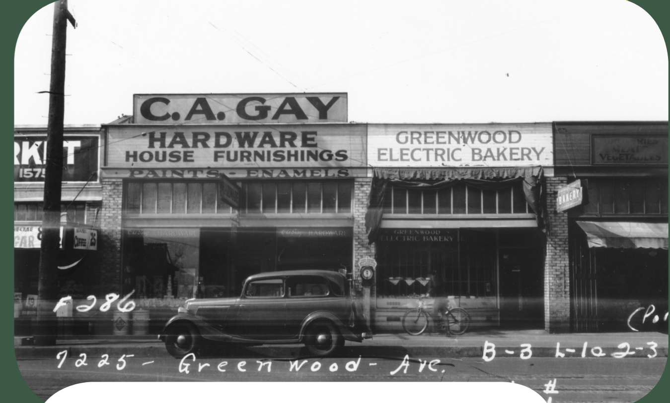
C.A. Gay Hardware and the Greenwood Electric Bakery, located at 7227 Greenwood Ave in the 1930's.