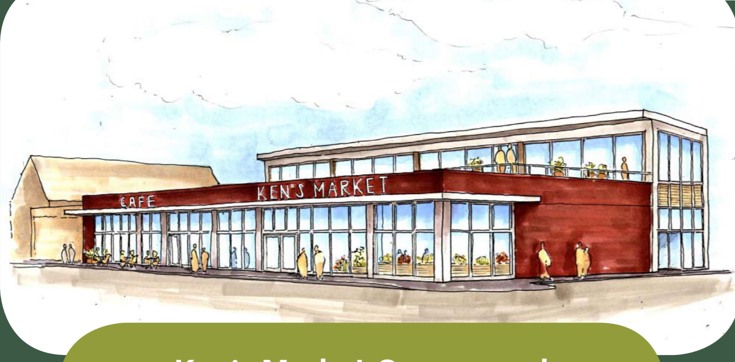
Artistic rendering of the remodeled store

Ken's Market Greenwood undergoes a major expansion and remodel, doubling the sales space. A continued push into fresh, natural, local & organic products, as well as a larger grocery section, take the store to a whole new level.