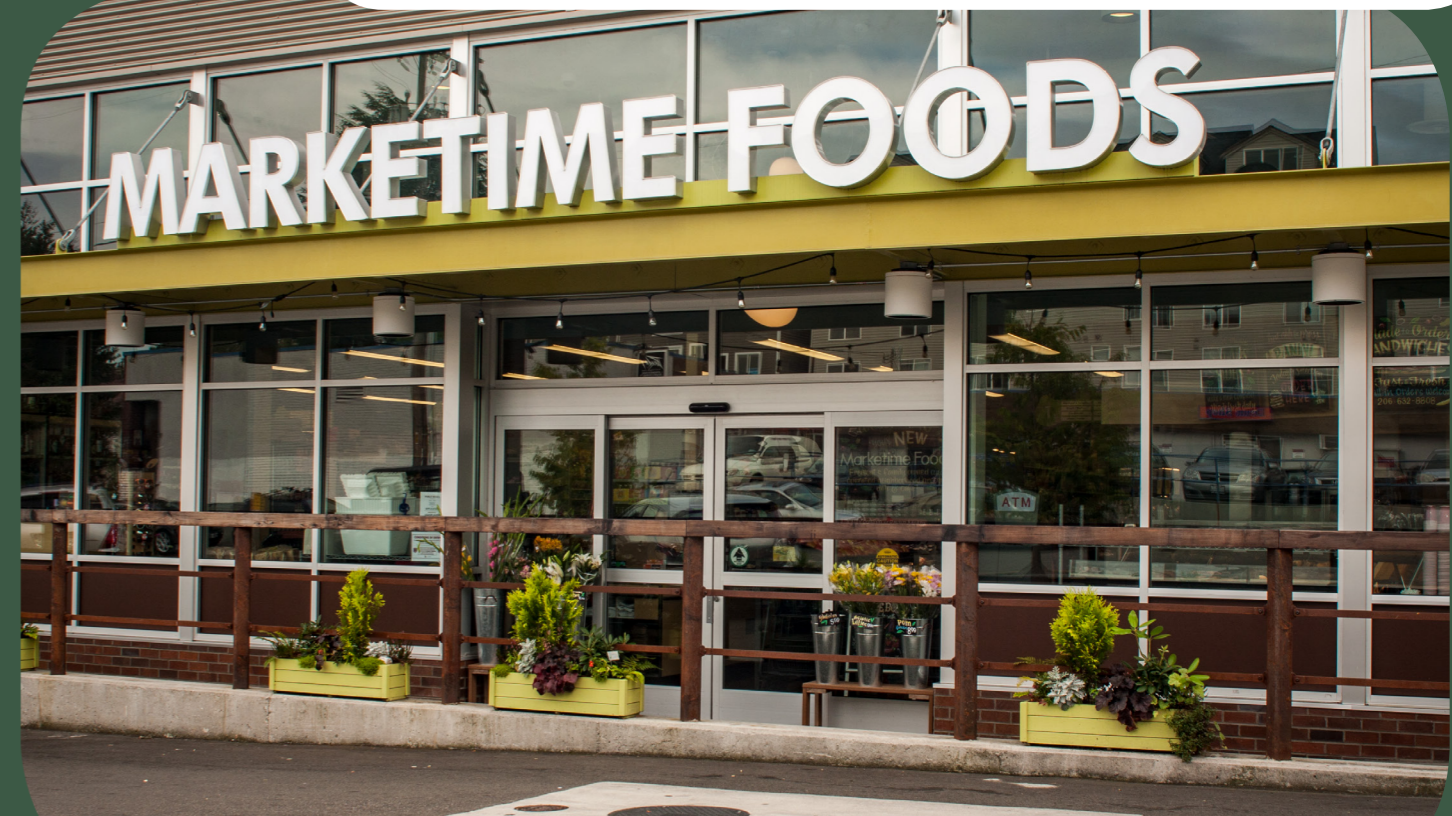
New & improved Marketime storefront

Marketime Foods receives an extensive upgrade and expansion, bringing both stores up to their present day look and feel.